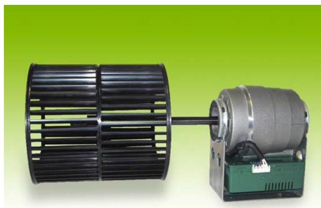
HEE fan, brushless motor and control electronics

At equivalent air flow rates, this redesign has reduced energy consumption by 15%.