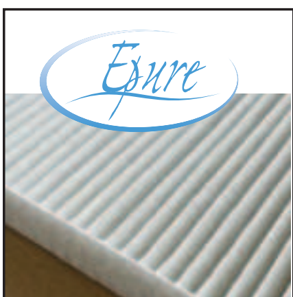
Filter ePM10 ≥ 50 % (ISO 16890)

Particle concentration is one of the major public health issues in terms of Indoor Air Quality. As air circulation experts, CIAT developed the Epure filter to provide high filtration efficiency.